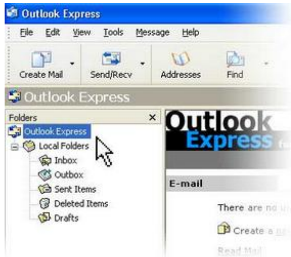
Outlook Express list of folders

Quick start. You'll notice that when you use Outlook Express regularly, Windows XP will put the Outlook Express icon on the Start menu (along with other programs you've used recently). In that case, just click the Outlook Express icon in the Start menu to open the program.